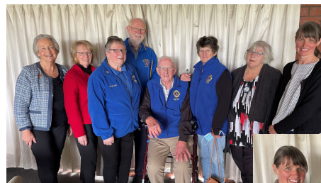
Members of the Lions Club of Colac (left) and Meriba Services Club (below)

The local Colac Service Clubs have been very generous in their support of Anam Cara Colac in recent months. We extend our sincere gratitude to these groups for enabling us to purchase valuable equipment. The Rotary Club of Colac West funded the purchase of a new macerator, while the Lions Club of Colac and the Meriba Services Club paid for our new commercial washing machine. The Colac Men's Shed also custom built some timber shelves for our dining room. Your efforts and support are greatly appreciated!